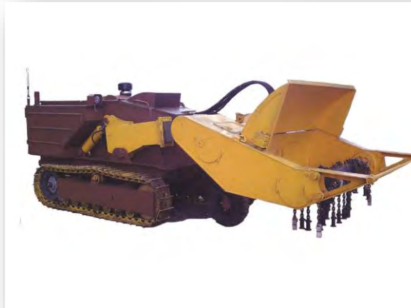
RC Flail Demining Machine