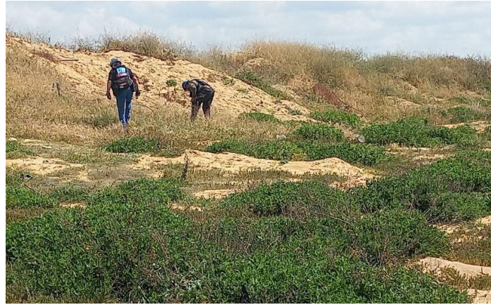
UNMAS assesses a site for OXFAM.

This collaboration with OXFAM highlights the transformative power of mine action, making land accessible for critical interventions that feed families, restore livelihoods and contribute to community resilience.