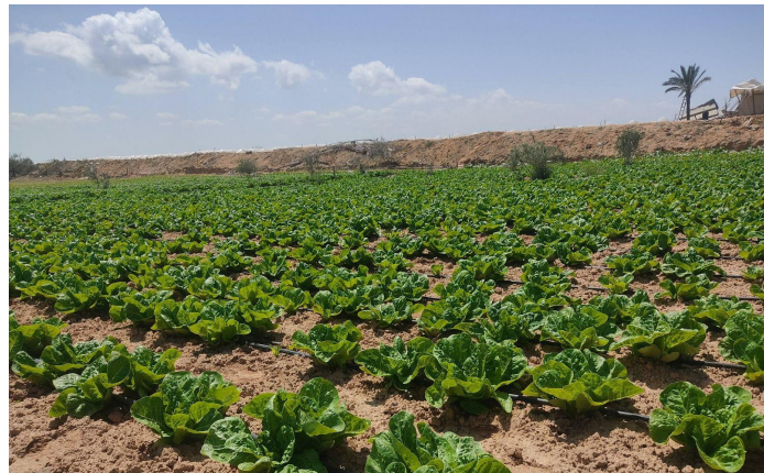
Communities benefit from productive agricultural activities after UNMAS completion of its EHA.