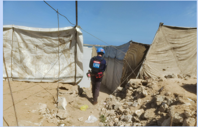
UNMAS assesses a displacement site to enable NRC to clear debris and open access for displaced people. 29 April.

Collaborating with NRC to support people living in displacement camps is a powerful example of working together to transform immediate danger into lasting security for displaced families.