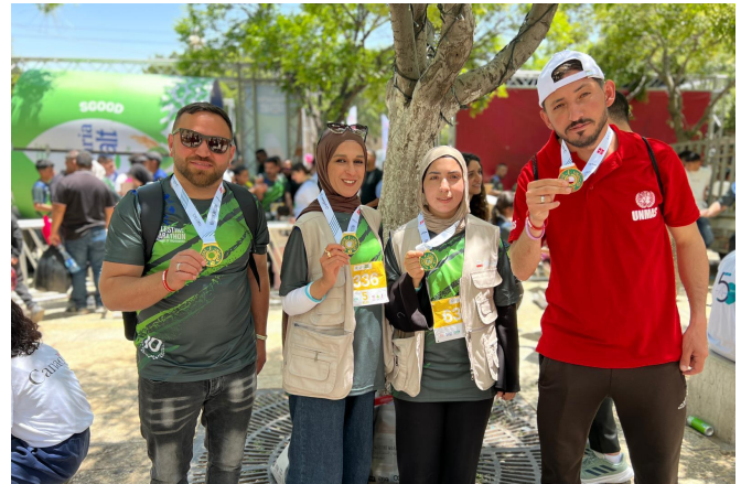
UNMAS and PalVision represent mine action at the Palestine Marathon. 8 May.