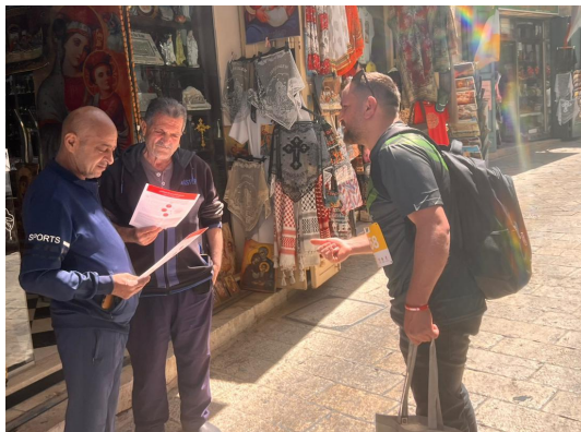
PalVision facilitators deliver risk education briefs to shop owners surrounding the Marathon. 8 May.