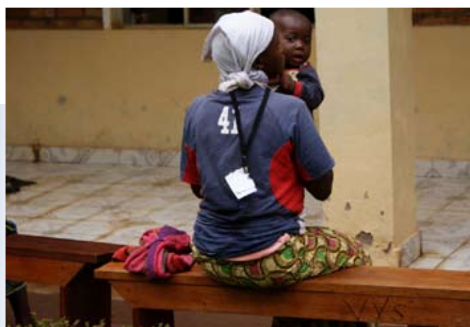
Mother taking care of her child at Panzi Hospital, Bukavu, February 1, 2013

In 2009, the Congolese government endorsed a nation-wide strategy against sexual