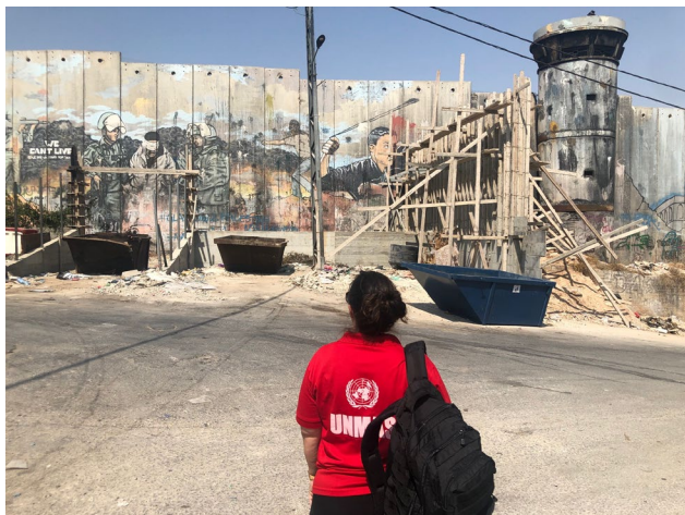
UNMAS at site visit to Aida Refugee Camp in Bethlehem, West Bank.

UNMAS is working with MSB (Swedish Civil Contingencies Agency) to develop and deliver risk education sessions aimed at helping residents of refugee camps to identify ways to reduce the risks from the use of chemical irritants (CI), such as tear gas, in the West Bank. The risk education sessions will be divided into identifying chemical and explosive risks, coping mechanisms and emergency first aid training.