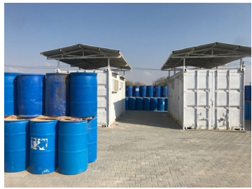
Temporary Explosive Storage Facility before and after renovations.

In 2018 UNMAS constructed a temporary explosive storage facility in Gaza for the protection of civilians from the risk from ERW. Prior to the building of this temporary storage facility, ERW were kept in the middle of the city prior to destruction, adjacent to schools and residential building posing a threat to all in the surrounding areas. Recently UNMAS implemented physical safety and access improvements, reducing the risks to both civilians and UNRWA staff working at the nearby UNRWA logistics base in Rafah. These measures included the refurbishment of the blast mitigation walls and the laying of an interlock roadway to improve access to the site.