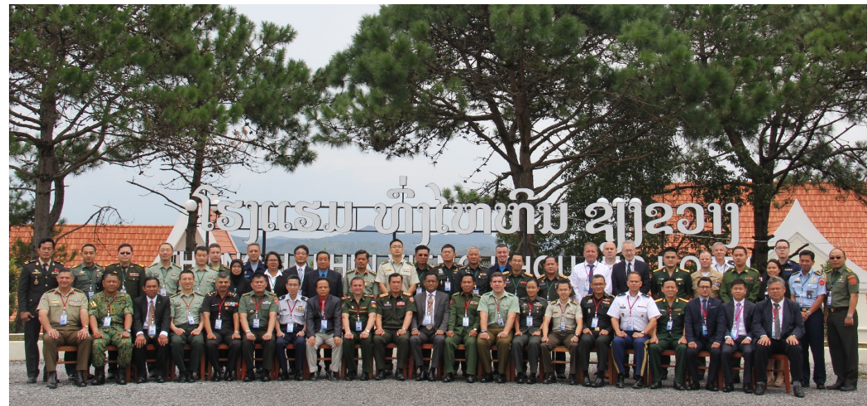
ADMM Plus EWG on HMA in Lao PDR, 24-27 April 2018