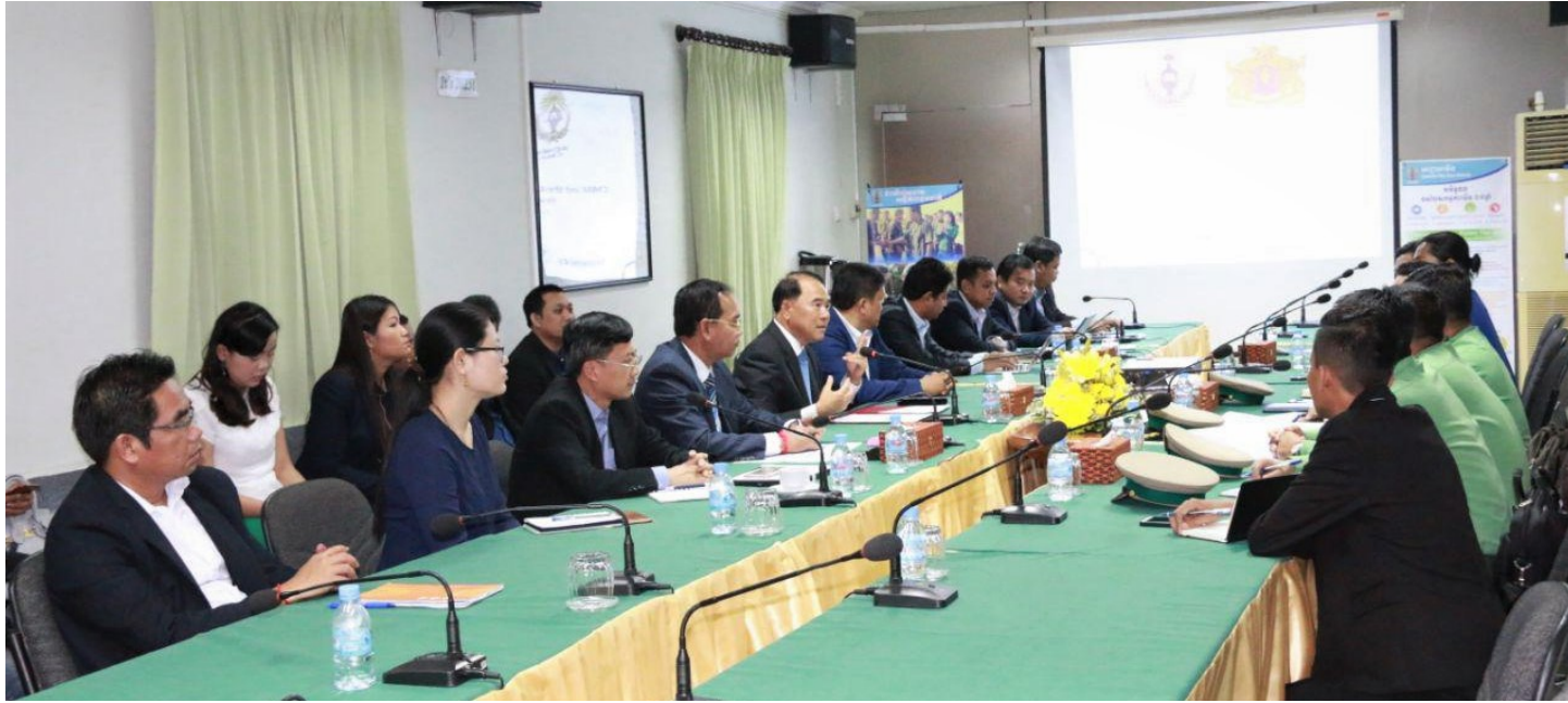
CMAA welcomed Myanmar Delegates during the CMAA and Myanmar Exchange Visit