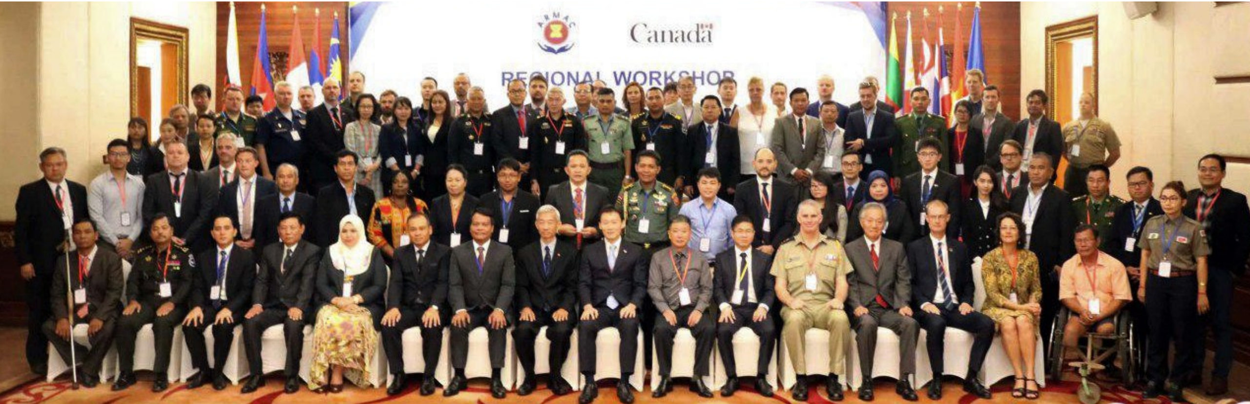
ARMAC REGIONAL WORKSHOP: “Enhance mine action knowledge and promote future platforms for mine action knowledge sharing for ASEAN Member States”