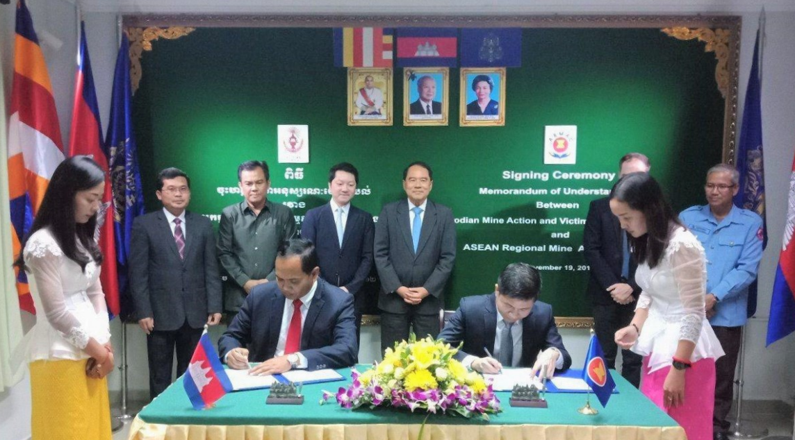
The Signing Ceremony for the MoU between CMAA and ARMAC, 19 November 2018