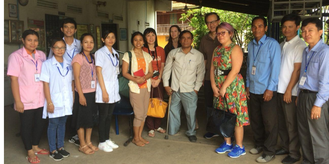
ARMAC and SingHealth Field Visit to a Rehabilitation Center 18 October 2018