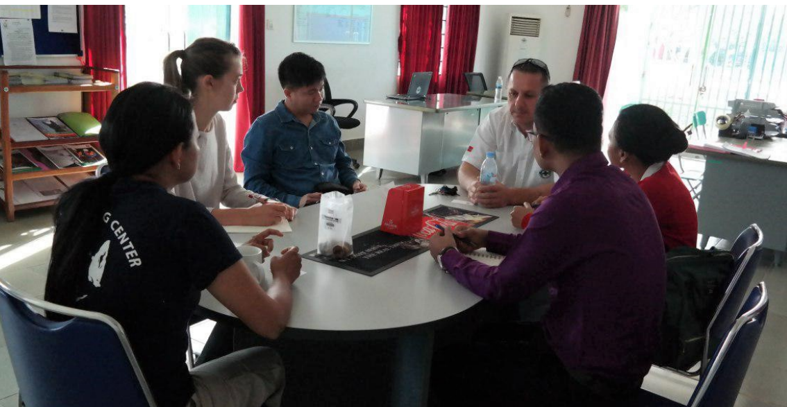
ARMAC Field Visit to NPA's Facilities, 3 July 2018