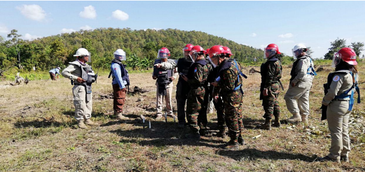
Myanmar Delegates' Field Visit during the CMAA and Myanmar Exchange Visit