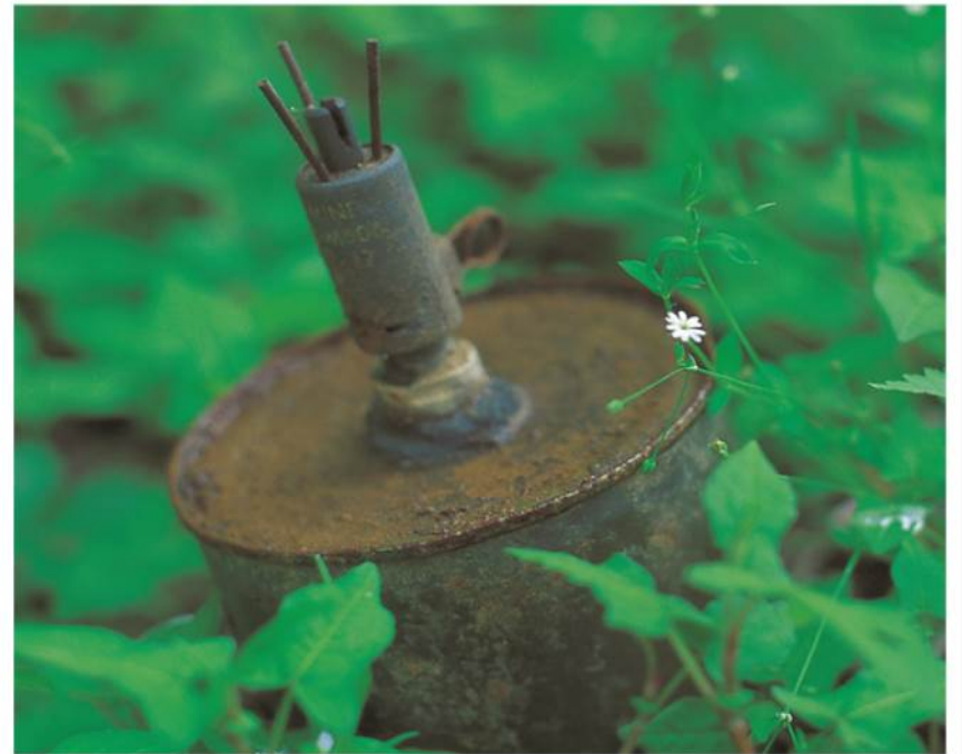
Anti-personnel Mine : M16