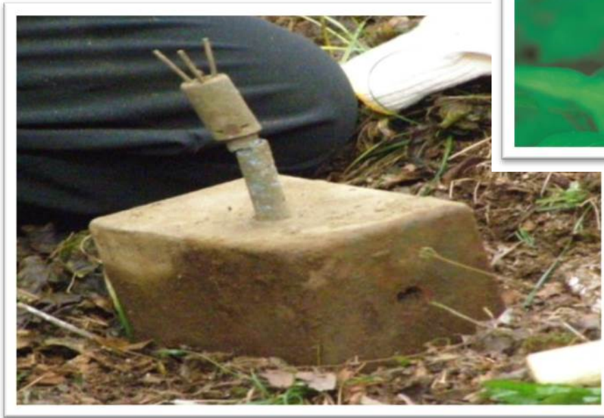
Anti-personnel Mine : M3