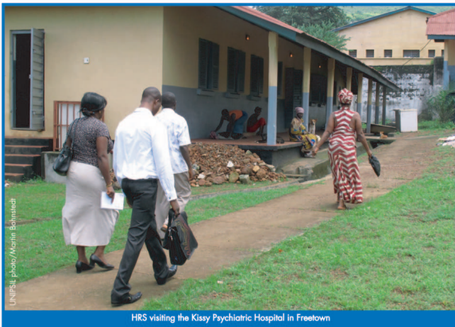
HRS visiting the Kissy Psychiatric Hospital in Freetown

by their families and are brought for medical treatment only when they become violent or difficult to manage. However, article 17 of the CRPD protects persons with disabilities from non consensual treatment.