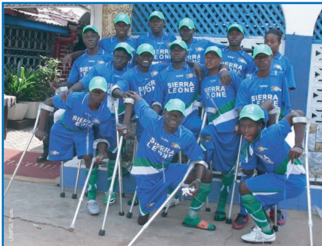
The Sierra Leone Amputee Football Team during an international tournament in Ghana

Only UNIPSIL HRS/OHCHR has been involved in the celebration of the International Day of Persons with Disabilities. As far as participation of persons with disabilities in UN programming is concerned, IOM reported that persons with disabilities are involved in the planning and monitoring of their programmes, especially those that have a direct impact on their lives. UNICEF has not directly involved persons with disabilities in programme development, though has kept their needs in mind during consultations and dialogue with Government, implementing partners and communities. In preparing, conducting and reviewing this report, UNIPSIL HRS/OHCHR extensively consulted with persons with disabilities and DPOs. UNIPSIL HRS/OHCHR maintains a fruitful collaboration with SLUDI and other DPOs which has resulted in the joint planning of activities and programmes.