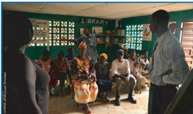
A focus group with persons with disabilities in Grafton, Western Area

Findings from primary research show that sensitization can be instrumental in changing the community perception towards persons with disabilities. Public campaigns in this regard would therefore be appropriate, as so far awareness-raising has been promoted largely by NGOs and DPOs 58 . All stakeholders interviewed by HRS share the view that the widespread negative perception towards persons with disabilities confirms the need for the Government of Sierra Leone to fulfill its obligations under article 8 of the CRPD. This is even more necessary considering that recent research on public perception of disability by government executives and local authorities confirms that senior public officials still keep in mind the traditional representation of persons with disabilities as expressed by the different ethnic terms 59 . This contributes to reinforce the same charity approach that the HRS has observed in many interviews with stakeholders at community level, where the focus is on the impairment of persons with disabilities with little regard to social, behavioural and environmental barriers that constitute obstacles for them.