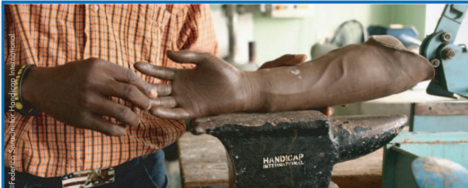
Rehabilitation technicians working in an upper limb prosthesis in Koidu Government Hospital rehabilitation unit, centre supported by Handicap International