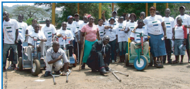
A Forum on political participation for person with disabilities organized by the Human Rights Commission in Freetown prior to the Local Council Elections in 2008

Local authorities interviewed confirmed that persons with disabilities are not involved in decision making at community level, often because people consider them neither trustworthy nor relevant to decision making affecting the community. However, good practices exist occasionally: for instance, in a bid to promote their inclusion a seat reserved for a representative of persons with disabilities was created in the District Council Committee in Kenema 84 . The Persons with Disability Act does not include any provision for involvement of persons with disabilities and DPOs in decision making at the local level. There are some positive examples: Handicap International, for instance, is implementing activities together with DPOs to promote inclusive local development in Freetown and Koidu. Among the stakeholders interviewed, some proposed the enactment of community by-laws to make provision for the inclusion of persons with disabilities in all community affairs. At the national level, the composition of the National Commission for persons with disability will be extremely important in ensuring meaningful participation of persons with disabilities in the implementation of the Persons with Disability Act 85 .