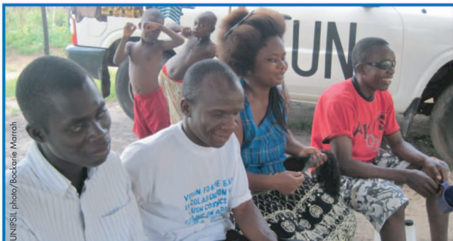
A. C. chairing a meeting of her organisation in Moyamba District

depend on their physical and intellectual aptitude, without sufficient consideration of modifications to enable people with disabilities to operate under optimum conditions 66 . The same study demonstrates that those who want to recruit persons with disabilities largely do so out of pity for them, thinking first of their deficiencies and limitations rather than a person's worth. The Persons with Disability Act is silent about public employment, although this is an area explicitly mentioned by the CRPD 67 . It is imperative that the future National Commission for persons with disability takes this into consideration while developing measures according to Section 6 (2)a of the Act. Affirmative action in promoting employment in the public sector for persons with disabilities is a recurrent demand from DPOs and emerged clearly during the National Consultative Conference organized by HRS in 2010.