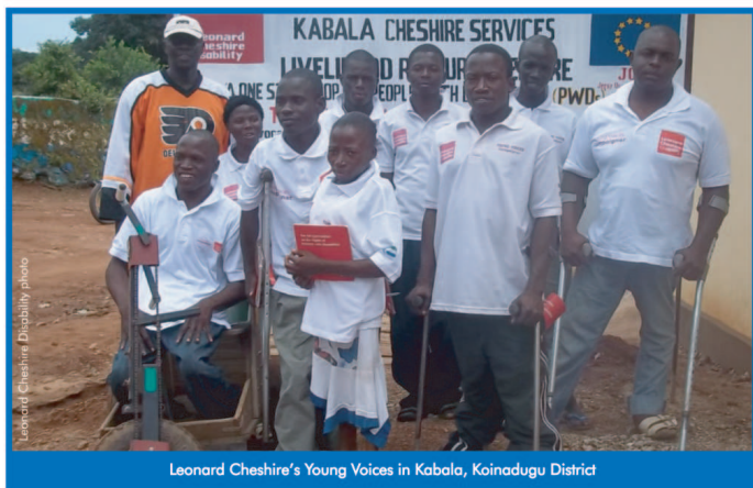
Leonard Cheshire's Young Voices in Kabala, Koinadugu District

In 2008 the Human Rights Commission of Sierra Leone (HRCSL) established a Different Abilities and Non-discrimination Office (DANDO). DANDO is tasked with monitoring the implementation of the CRPD, create awareness on the rights of persons with disabilities, develop programmes to promote equality and non discrimination and support the government in implementing policies for persons with disabilities. The HRCSL played an important advocacy role in the ratification of the CRPD by the Government and was instrumental in the review of the Persons with Disability Bill that led to its enactment. In 2009, DANDO conducted a rights of persons with disabilities assessment survey in the Western Area. Action based on the findings included a dialogue session between DPOs and authorities on access to justice for persons with disabilities as well as outreach activities in the Western Area on the rights of persons with disabilities. In its latest "State of Human Rights in Sierra Leone" report for 2010, the HRCSL reports findings concerning access to justice, shelter, education, health and employment and highlights a number of recommendations in line with the findings of this report 89 . As in previous years, a Braille version of the report was also produced.