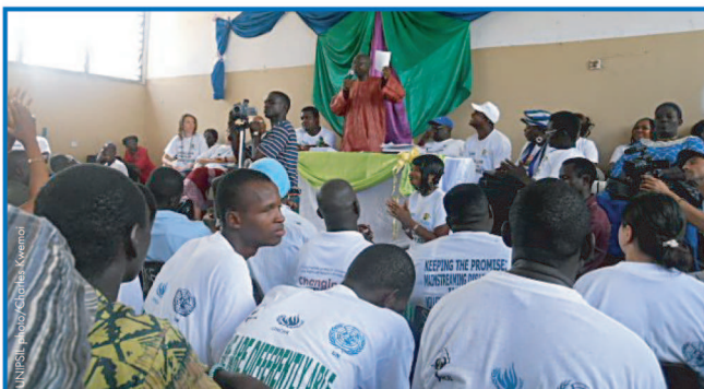
The then Minister of Social Welfare, Dr. Soccoh Kabbia, flagging the Persons with Disability Bill on the IDD 2010, three months before its enactment

In several areas, challenges are structural and related to the condition of Sierra Leone as a developing country. In this regard, article 4 of the CRPD incorporates in the Convention the principle of progressive realization of economic, social and cultural rights. Accordingly, “each State Party undertakes to take measures to the maximum of its available resources and, where needed, within the framework of international cooperation, with a view to achieving progressively the full realization of these rights” 88 . While this does not exempt the State from those obligations that are immediately applicable, it allows putting other ones into context. Some of the measures envisaged by the Act, such as the extension of free health care to persons with disabilities, represent indeed important steps to mark gradual improvement in the area of economic, social and cultural rights of persons with disabilities.