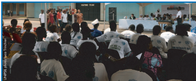
Pupils of the Milton Margai School for the Blind performing at Human Rights Day, 10 December 2010

In terms of health, challenges are acknowledged by the Agenda for Change in providing quality health care to vulnerable populations. Mental health is indicated as one of the strategic priorities 50 . While initially persons with disabilities were expected to be among the beneficiaries of the Free Health Care scheme launched in 2010, only pregnant women, lactating mothers and children under five years old were eventually included. With the enactment of the Persons with Disability Act this gap would be filled. The Directorate of Primary Health Care at the Ministry of Health includes a disability department. Three National Rehabilitation Centres, equipped and supported by Handicap International since 1996, provide treatment free of charge to persons with disabilities in Freetown, Bo and Koidu. While the Ministry of Health is expected to take over full control of these centres by January 2012, the Government has not budgeted appropriate financial allocation to this end. In the absence of new developments, this would seriously challenge the possibility to continue offering treatment 51 . Handicap International has also supported the Ministry of Health to develop a Physical Rehabilitation Policy Guideline, not yet launched at the time of writing.