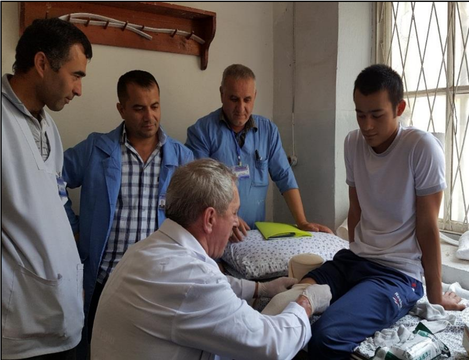
On-the-job capacity building training for P/O technicians in the SUEPOP