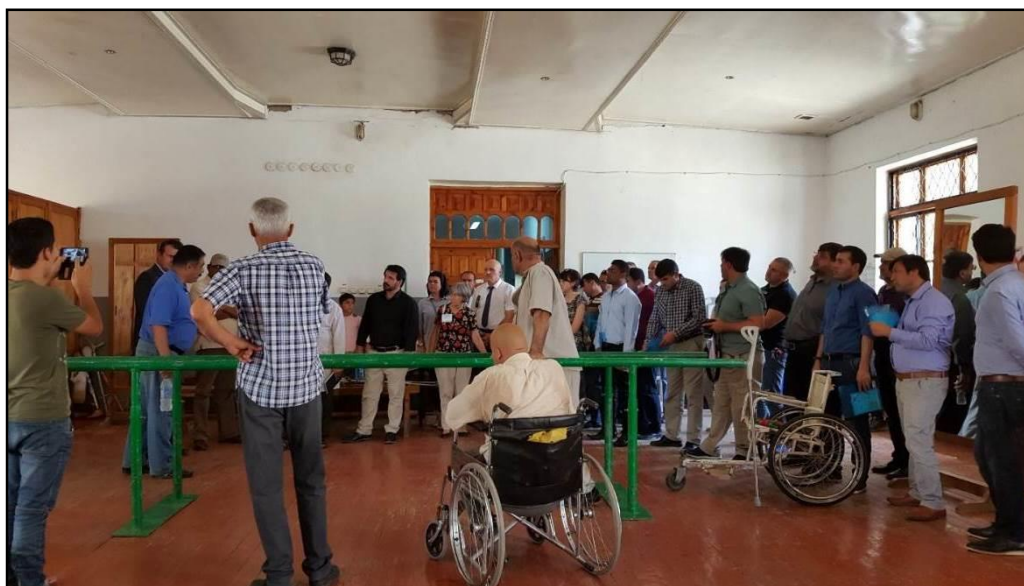
Visit to the Orthopedic center in Dushanbe during the JMU SMC Course, July 2018.