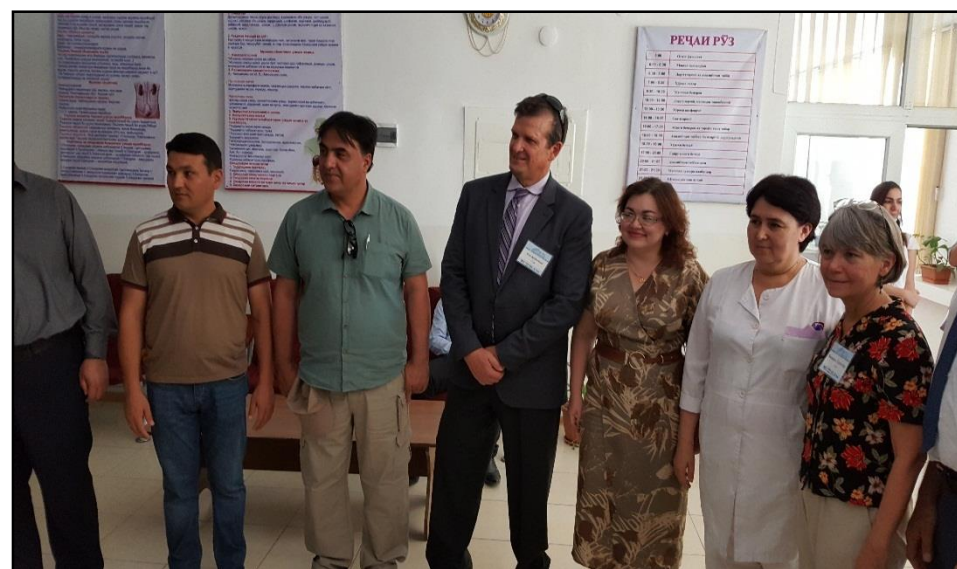
Victim Assistance site visit for participants of the Senior Managers' Course in Mine Action in Dushanbe.