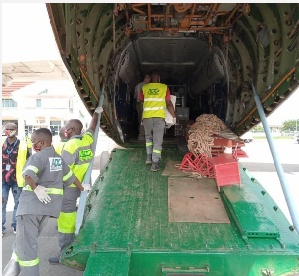
Loading equipment on to a UN aircraft destined for AU Observers Mission in the Central African Republic (CAR)

At the request of the African Union Commission (AUC), UNOAU coordinated air transportation of critical electronic equipment for the AU Military Observers recently deployed to Bangui city in the Central African Republic (CAR). The equipment was being held in Douala, Cameroon at the AU Continental Logistics Base but due to the COVID-19 pandemic, there were limited flight options available with high freight costs. UNOAU's Mission Support Planning Section (MSPS) coordinated efforts to facilitate air transportation from Douala to Bangui at no-cost to the AU. This was the first time the MoU between the UN and AU Missions in CAR signed on May 8 was enacted. Read more