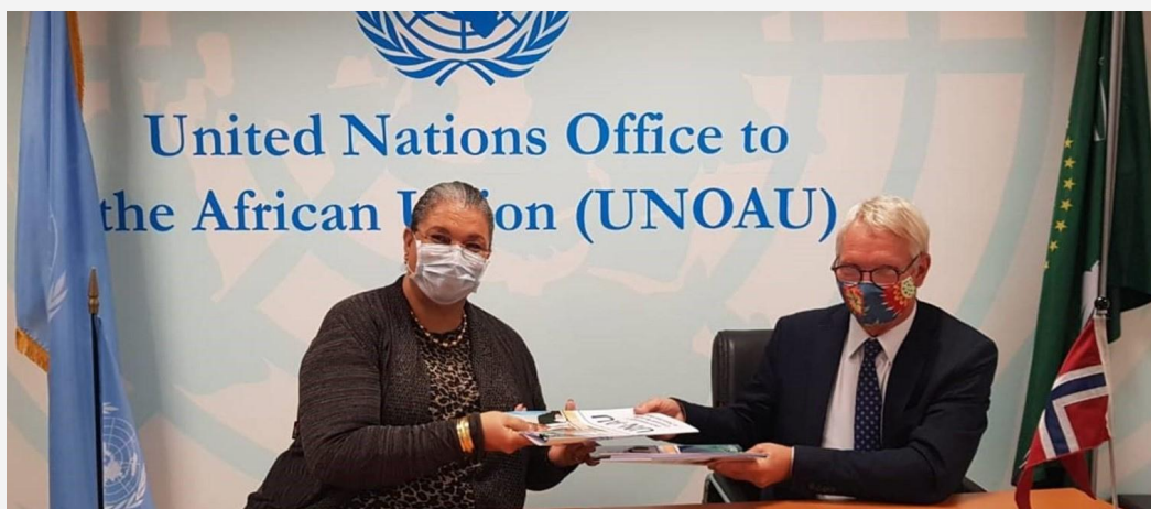
SRSG and Head of UNOAU, Hanna Tetteh (left) exchanges signed agreement with Ambassador Morten Aasland (right), Permanent Representative of Norway to the African Union and the United Nations Economic Commission for Africa

Norway signed an agreement with the United Nations Office to the African Union (UNOAU) on July 14 th , 2020 for support to the implementation of the UN-AU partnership in peace and security. The agreement will be implemented from July 2020 to December 2022 at a cost of 12 million Norwegian Kroner (approx. US$ 1.3 million). The agreement is in support of the objectives outlined in the Joint UN-AU Framework for Enhanced Partnership in Peace and Security .