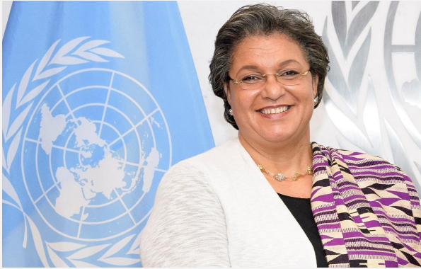
Special Representative of the Secretary-General (SRS) to the African Union and Head of UNOAU, Hanna Tetteh