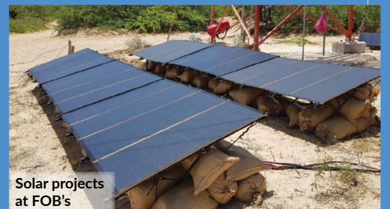
Solar projects at FOB's