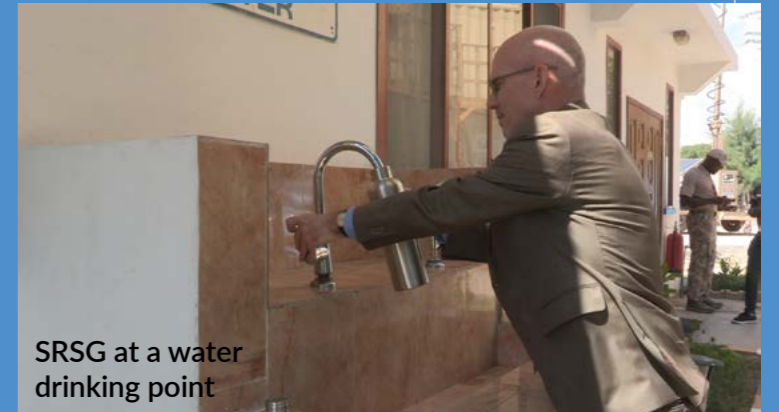
SRSR at a water drinking point