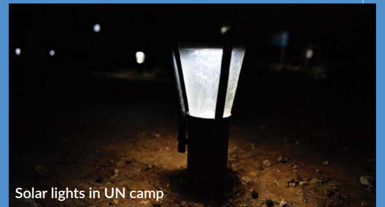
Solar lights in UN camp