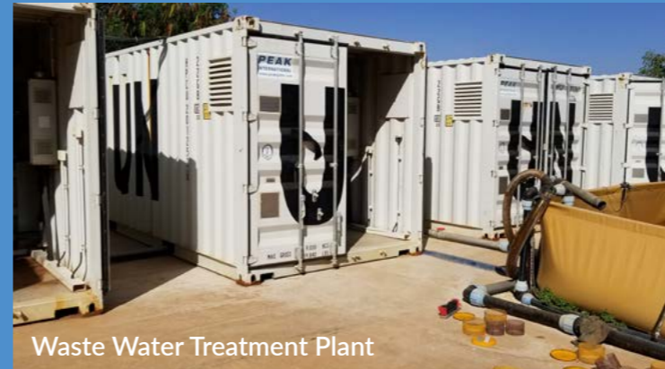
Waste Water Treatment Plant